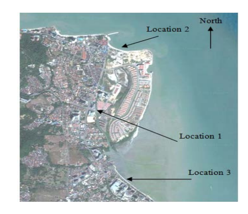
Fig. 1: Sampling locations (based map sourced from Google earth)

At each location, a 25 L of sample were collected and also in situ measurements of water temperature