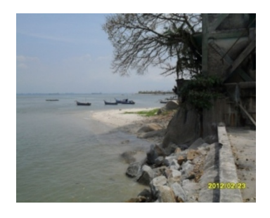
Fig. 3: Location 2-north of Tg. Tokong