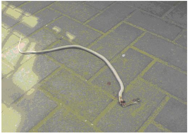
Figure 1: A Snake entered the PFS fuelling area and was killed by attendant.

located closer to agricultural areas. The incidence increased during the harvest time. Snakes are seen more often in the spring or fall as they search for food or move to and from a hibernation area. More than 80% of snakebites occur when a person is trying to kill or handle a snake. In general snakes are just as frightened by a person as possibly person frighten by them. Most of the snakebite cases reported during data collection were on ankle, feet and hands. The snakes observed during operation and maintenance stage at PFS are shown in Figure 1-3.