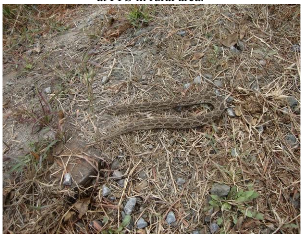
Figure 3: Snake was found closer to PFS.