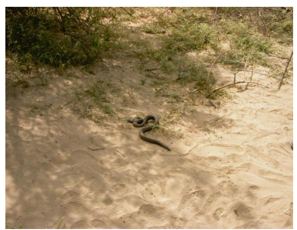
Figure 2: The Snake was observed besides the boundary wall at PFS in rural area.