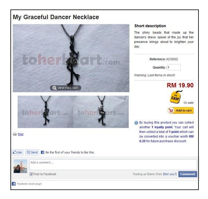
Figure 3. Product Page of ToHerHeart.com with Social Plug-ins

Participants from Group A will have to explore the website before the integration of social plugins (pre-integration). For Group B, participants will have to explore the website after its integration with social plugins (post-integration). The experiment was conducted online and participants could complete the study from any computer with Internet connection. Questionnaires were distributed to participants though email. After completion of the task, users will need to complete the questionnaire about their experiences on the online gift shop they visited.