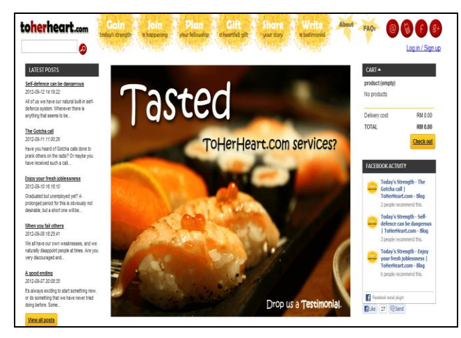
Figure 2. Home Page of ToHerHeart.com